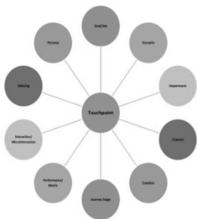
Figure 1: Silo Model

The task before us is to move toward a Collaborative Model (Figure 2), which involves more communication across the entire congregation and includes members in deeper spiritual practices. The past decline in membership makes sense given the lack of relevance for those not included in decisions, as well as the relatively light involvement of Elders outside their spheres of interest (a rarity in the PC USA). This also helps explain how Park Church came to the point where a recent Session was mis-performing enough to be disbanded by the Presbytery. In our current Session study, we recently noted that “engagement” across the congregation is much lower than the national average – which is to be expected when membership hasn't included regular participation in decisions.