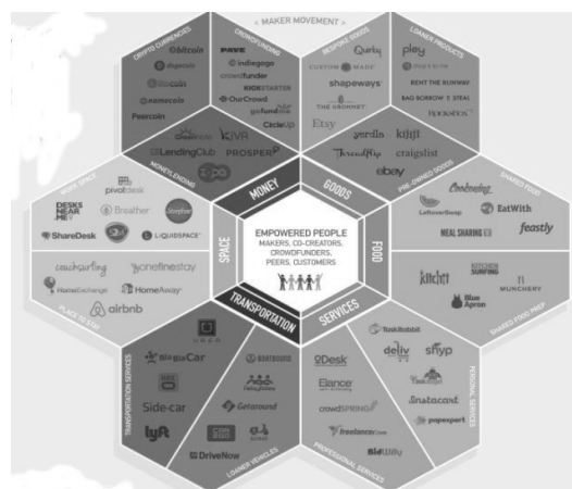
Figure 2: Collaborative Model