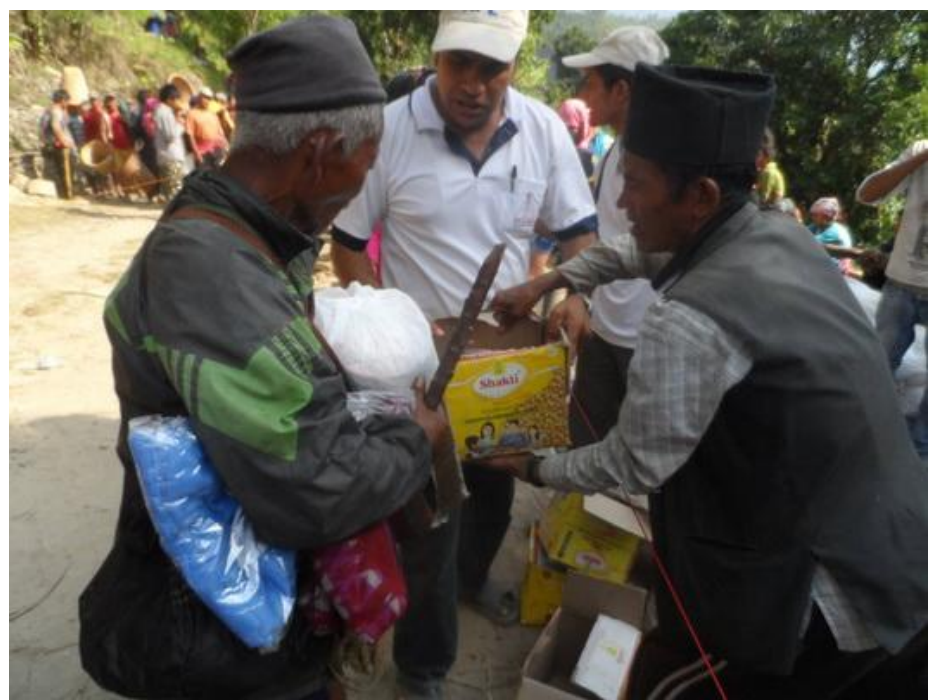
This man is so happy that someone cares and helps.

People in Nepal, also, are calling upon the God that makes and keeps promises. He is answering in a variety of ways as a hungry people cry for help. Here are some visual records of the efforts and relief many of you have helped provide as God answers them through all of us.