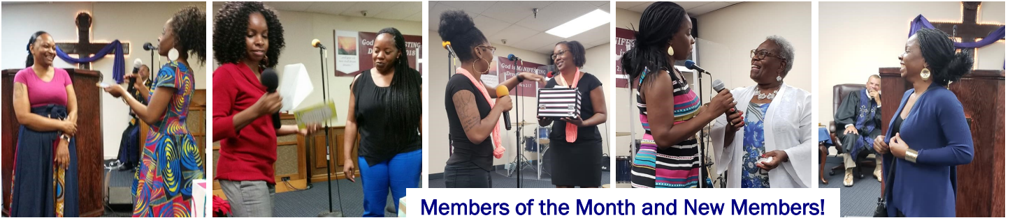
Members of the Month and New Members!