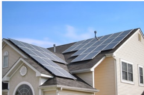
SOLAR PANELED HOME