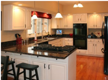
ENERGY SAVING KITCHEN