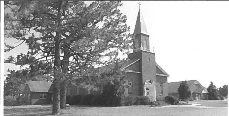
Culdee Presbyterian Church

U.S. Postage Paid West End, NC 27376 Permit No. 6