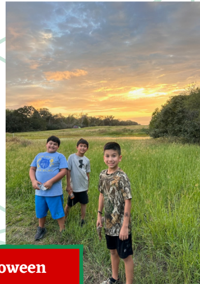
Pack 4545 Halloween Campout Lake Texana 2023