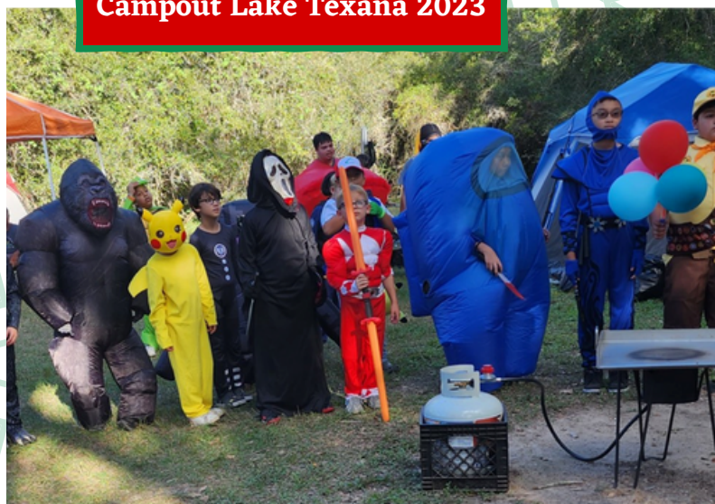
Pack 4545 November 2023 Pack Meeting