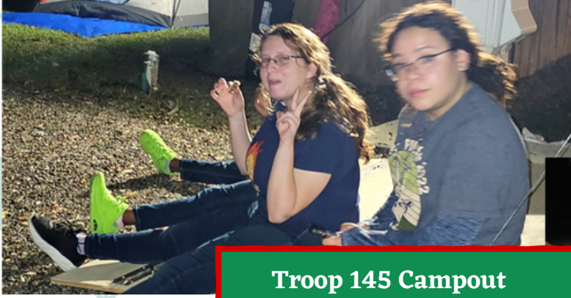
Troop 145 Campout November 2023