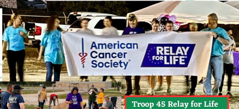
Troop 45 Relay for Life November 2023