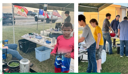
Troop 45 Goose Island State Park November 2023