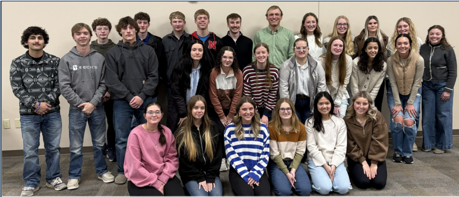
Thank you to the UNK/UNL students that conducted our Confirmation Retreat! Please pray for our 23 candidates as they continue to prepare for this special Sacrament to be celebrated on April 18th, 2026 at the 5pm Mass!