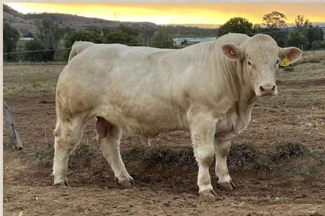
Top Seller 2023 Lot 5 Charnelle Station Master (PP) $46F sold to Mark Noller, Top Camp Cattle Co Toowoomba for $19,000

Many Thanks to Nutrien Ag Solutions Toogoolawah, for sponsoring The Coolabunia Classic Charolais Bull Sale with 2 x 5 Litres of MOXIMAX POUR-ON – one each goes to the Highest Priced Bull Buyer, and one goes to the Highest Volume Bull Buyer.