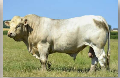
Johnny (P) (FF) Sire of lot 7