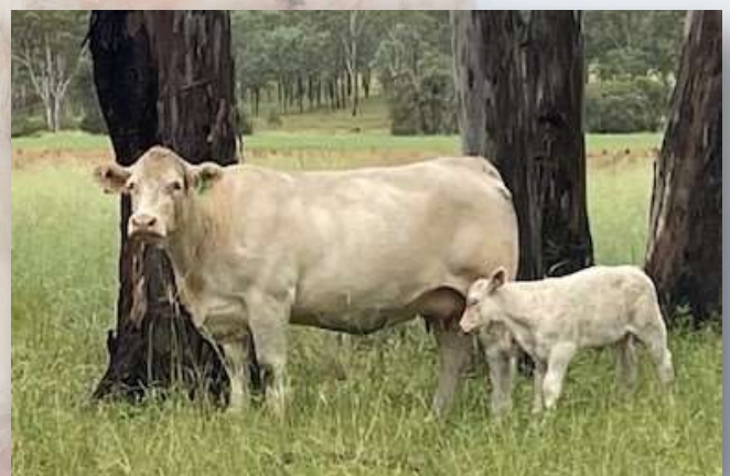
Elridge B-Wicked Q91E (P) Dam of lot 40