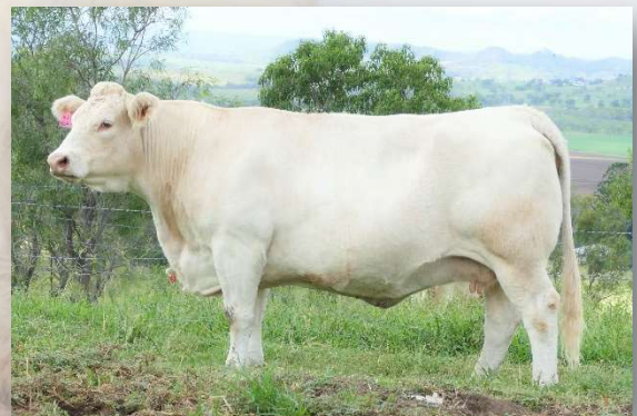
Charnelle Elegance 6 H45E – Dam of lot 2