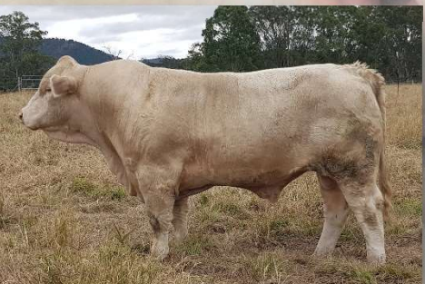
River Run Rocketman (PP) Sire of lot 18