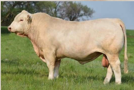
L T Authority (PP) Sire of lots 8, 9, 36,42 & 54