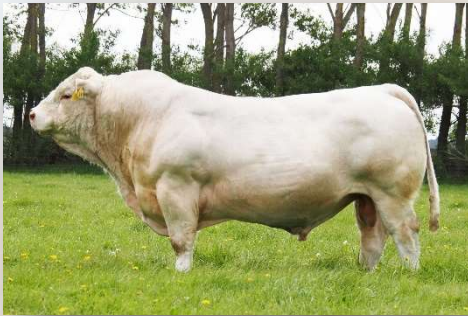
Silverstream Padra (PP) Sire of lots 1, 37 & 46