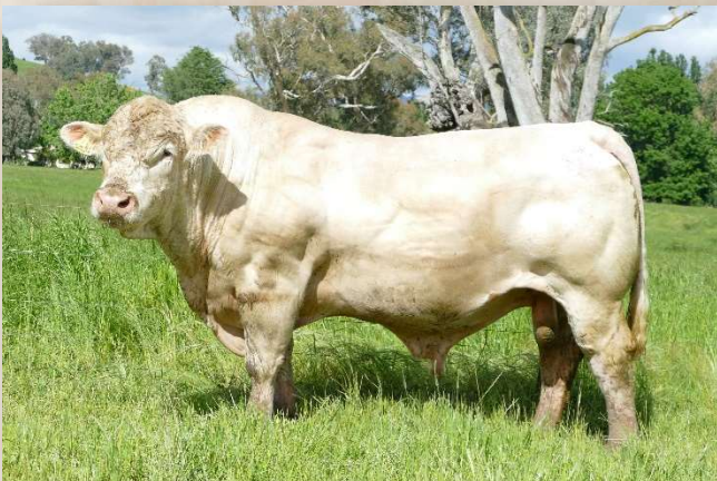
Charnelle Panama P25E (PP) Sire of lots 2 and 40