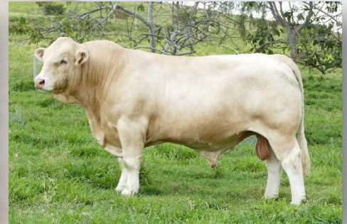
Glenlea Quartermaster (P) Sire of lots 43,44 & 47