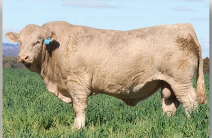
Silverstream Saint Martin (P) - Coming soon! New Charnelle Charolais & Black Duck Charolais Semen Sire. Semen enquires Welcome