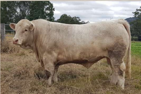
River Run Rainman (P) Sire of lot 27