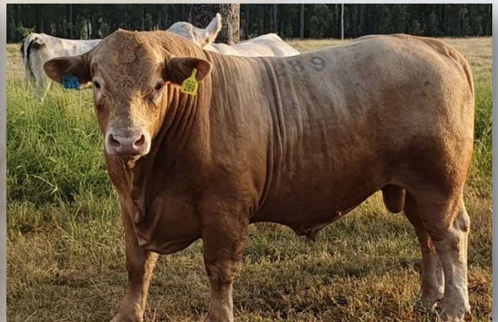
Calmview Lucky – Sire of lots 28 - 34

"Whoever is happy will make others happy too" – Anne Frank