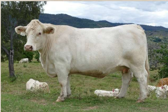
Chardonnay Friesia P9E (PP) (Elders Blackjack) Dam of lot 1