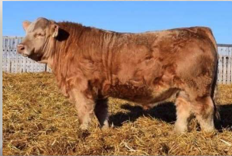
Pro-Char Diamondback (PP)(R/F) Sire of lots 3, 38 & 39