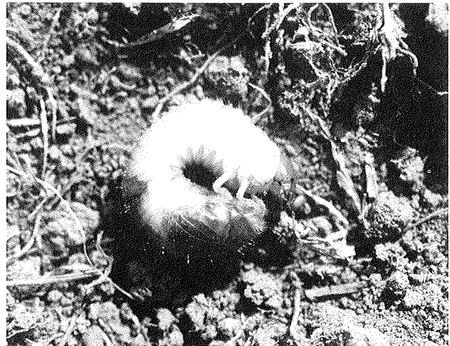
Figure 1. Third-instar (mature) grub.

Adults emerge from the soil June through early August. The adults emerge at about dusk and swarms of males fly low over the turf in search of females. Eggs usually are laid in the top 2 inches of soil. The developing grubs will reach the final instar (third) in late summer and early fall. Most damage to turf is done in September and early October when the grubs are full-