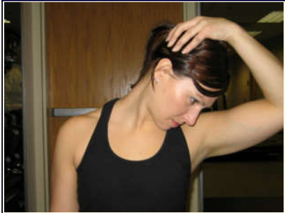
Diagonal Upper Trapezius Stretch