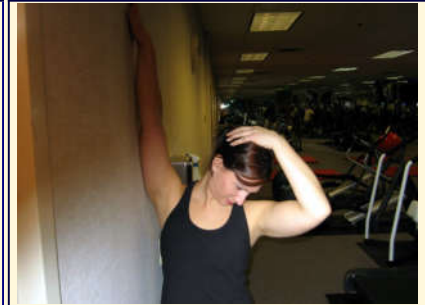
Wall Supported Levator Scapula Stretch