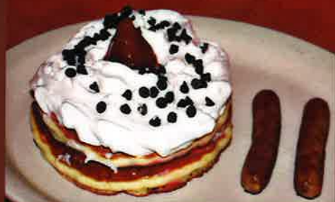
STRAWBERRY STUFFED SHORT CAKES