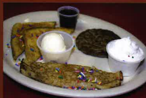
KIDDIE CREPE COMBO