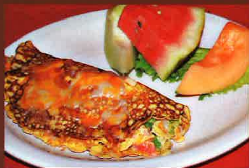
POTATO CAKE SCRAMBLER