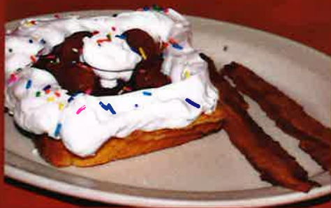
RAINBOW STUFFED FRENCH TOAST