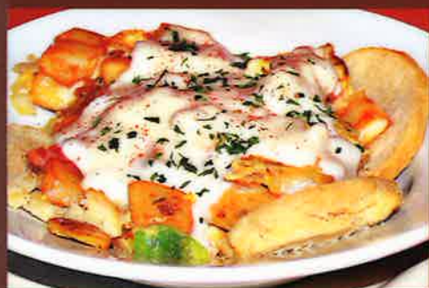
GRANDPA'S BISCUIT BOWL