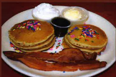
FUN CAKES COMBO