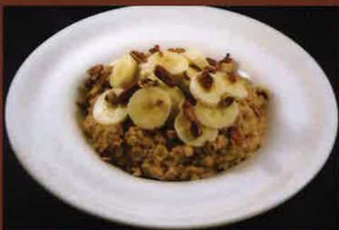
GOURMET BANANA WALNUT OATMEAL