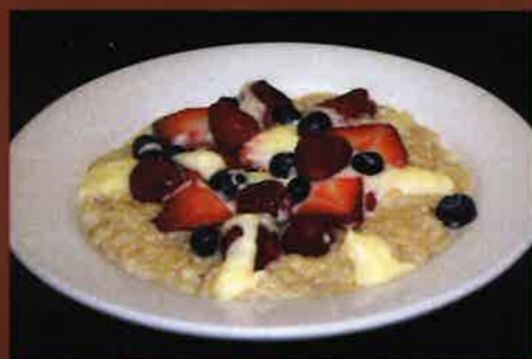
GOURMET TRIPLE BERRIES & CREAM OATMEAL