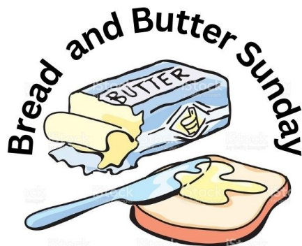
The Third Sunday of every Month

Saint John Quick Fact: was the first to see the grave & believe Jesus had risen, one of the 7 disciples who saw Jesus at the shore. His close relationship with God earned him the name "the disciple whom Jesus loved".